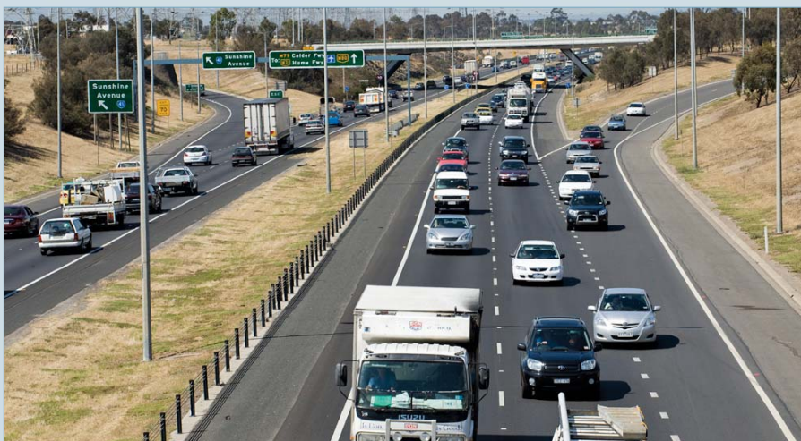
The upgrade will help ease congestion on the M80 Ring Road.

For more information about the M80 Ring Road Upgrade, Phone the VicRoads project office on (03) 9094 4600 OR Write to M80 Ring Road Upgrade, PO Box 208, Niddrie, VIC 3042 Email m80upgrade@roads.vic.gov.au