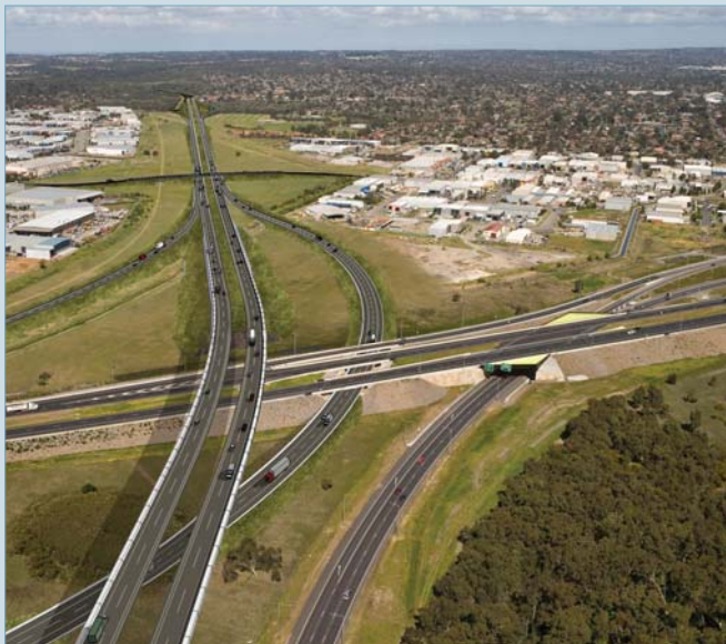
Artist impression of the EastLink interchange.