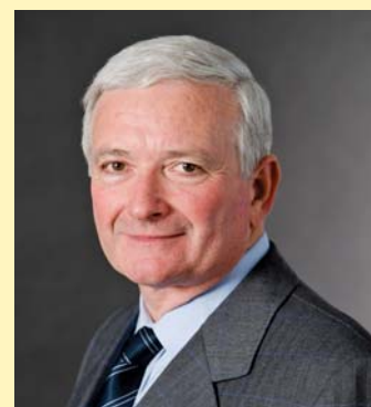
Nick Greiner AC...guest speaker at the John Shaw Award dinner in July.

The Daley luncheon in Sydney provided an opportunity for RA guests to discuss a range of issues with the Minister, including RA's Capacity Policy Chapter and its focus on greater