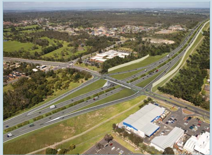
Artist impression of the Cranbourne - Frankston Road interchange.