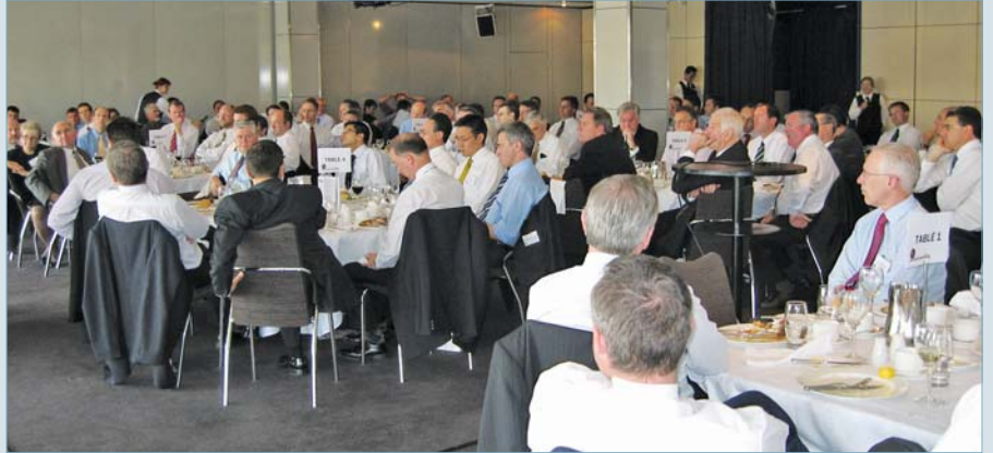
ARF Members and Guests at the Sydney Luncheon in April.