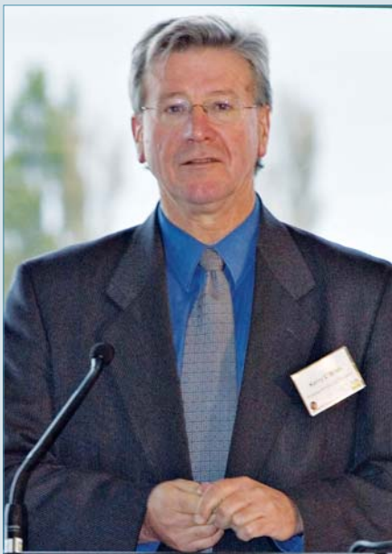
Senator Kerry O'Brien presents the Federal Opposition's views to the ARF Forum.