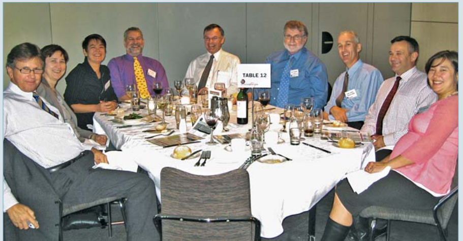
NRMA Corporate Table at the ARF Lunch in Sydney.

Successful member lunches were held in Sydney on 19 April and in Brisbane on 18 May.