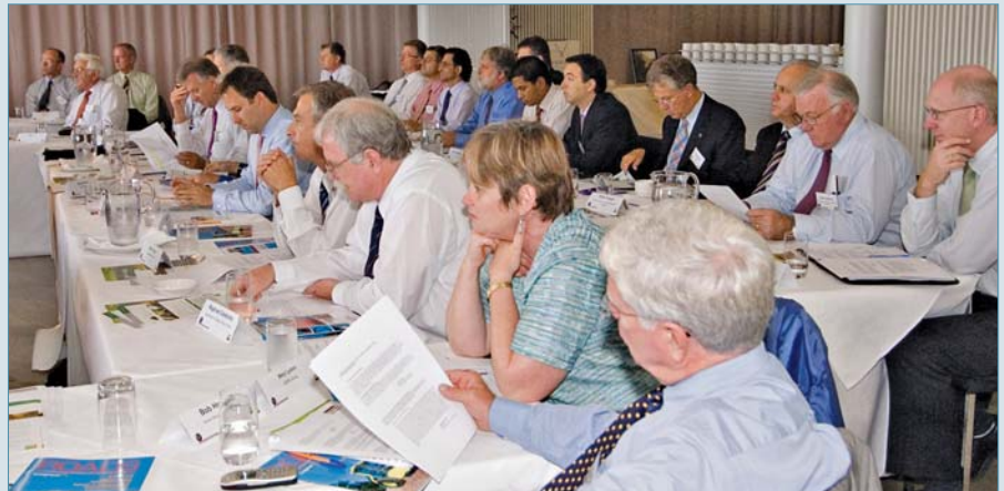
Participants at the Forum meeting in Melbourne.